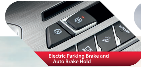
Electric Parking Brake and Auto Brake Hold