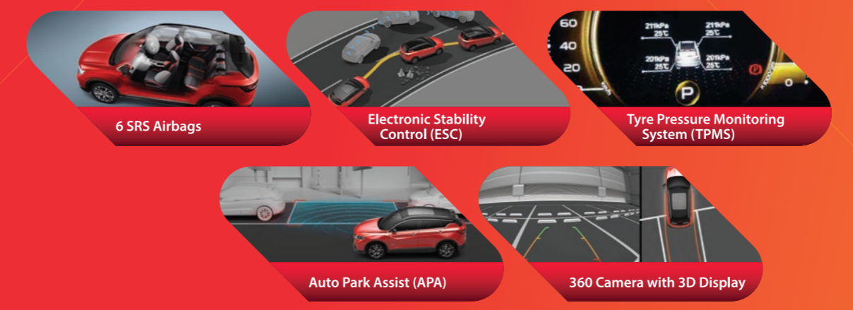
6 SRS Airbags

“ Keeps you and your passengers safe with a host of advanced safety features to detect and prevent imminent danger ”