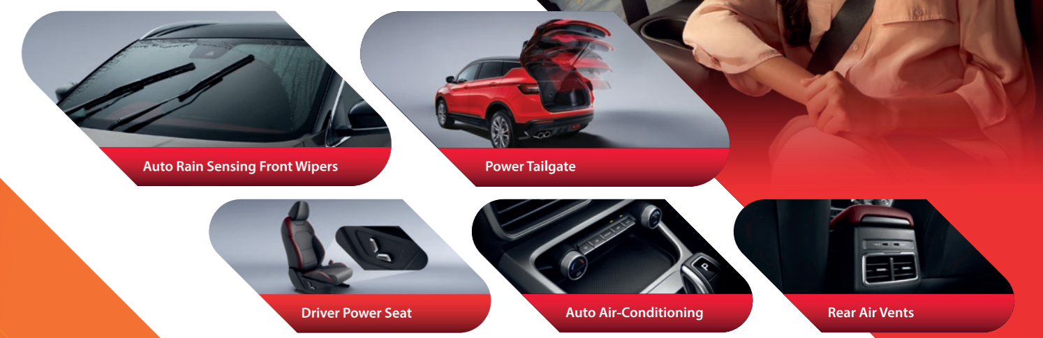
Auto Rain Sensing Front Wipers

“ Everything is designed to provide utmost comfort for you and your passengers ”