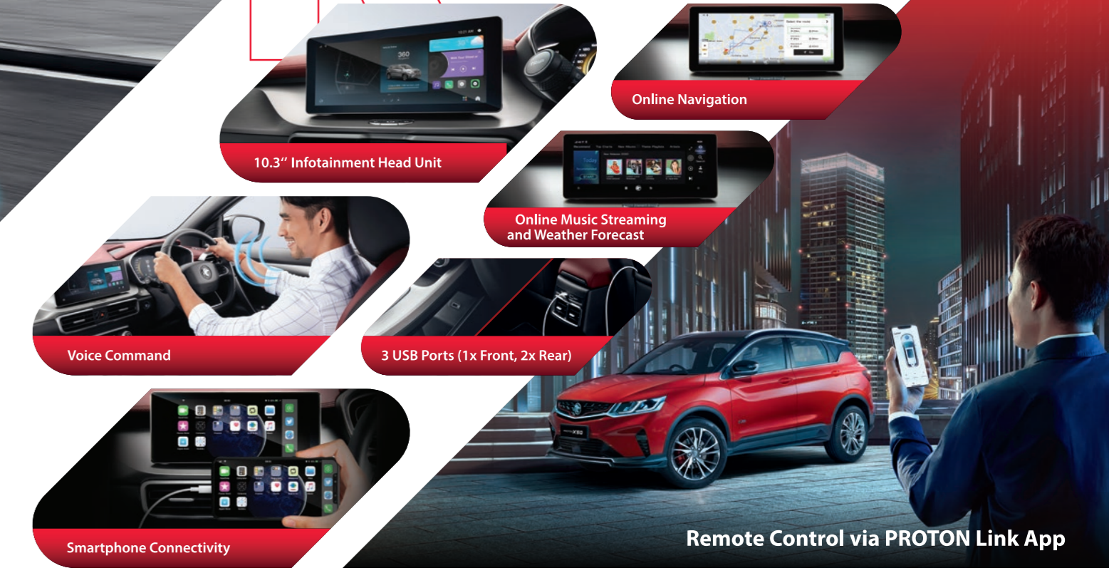
10.3" Infotainment Head Unit

“ Convenience, powered by innovation and accessed by saying "Hi PROTON" ”