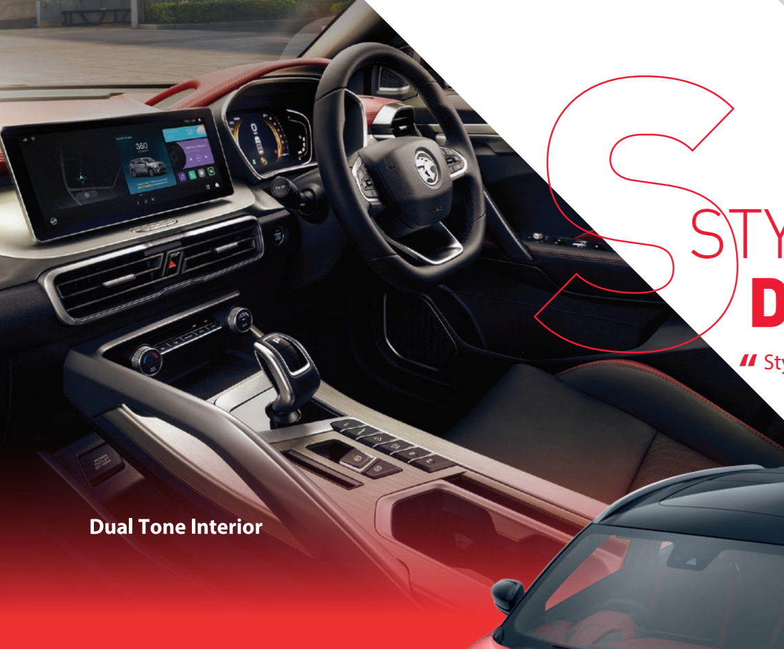
Dual Tone Interior