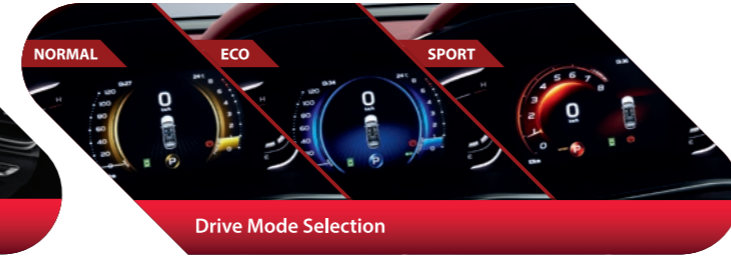
Drive Mode Selection