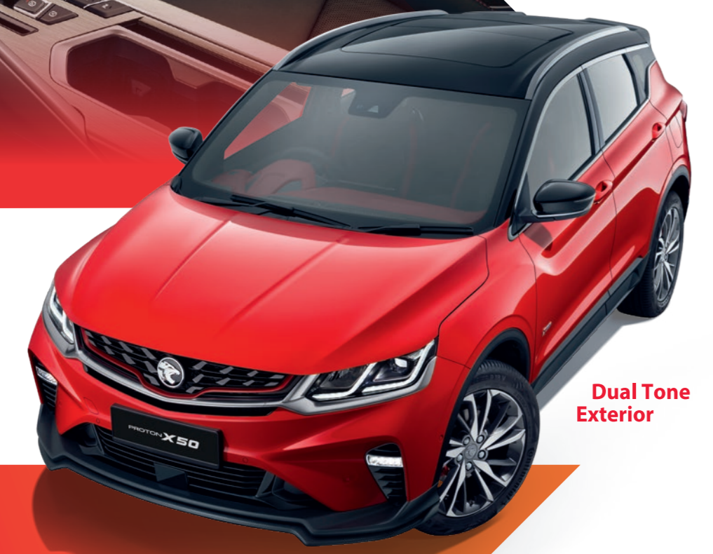
Dual Tone Exterior

“ Styling that pairs its sleek silhouette with sporty accents to make a bold statement ”