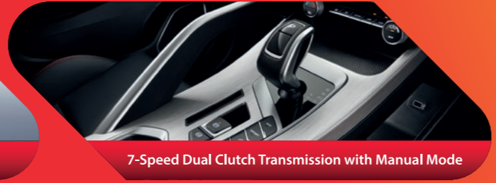
7-Speed Dual Clutch Transmission with Manual Mode