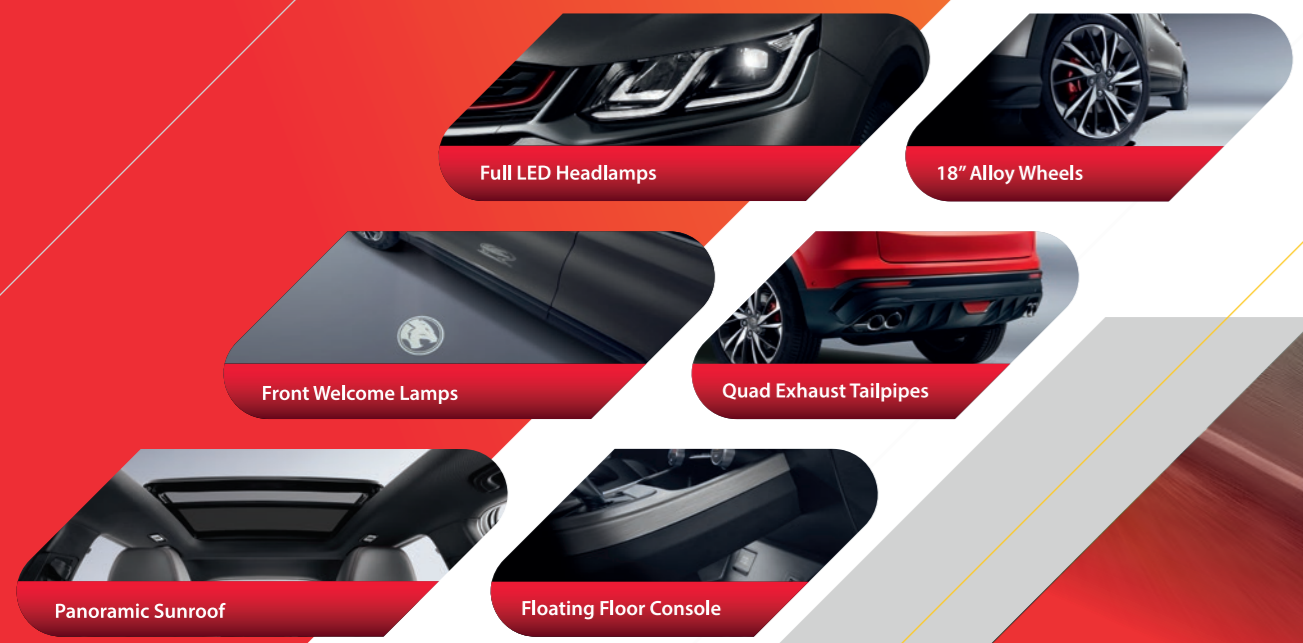
Full LED Headlamps