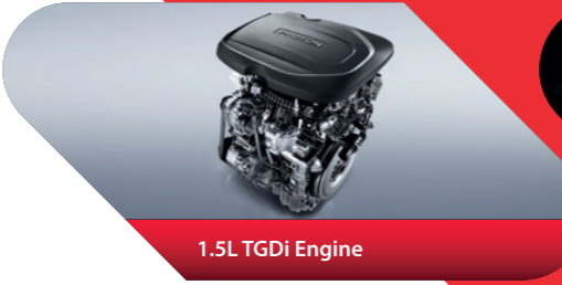
1.5L TGD Engine

“ Class leading performance that has been engineered to amaze ”