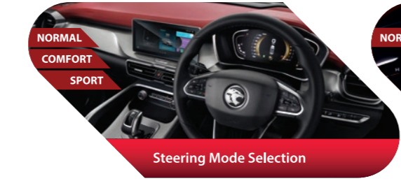
Steering Mode Selection